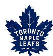
Toronto Maple Lea